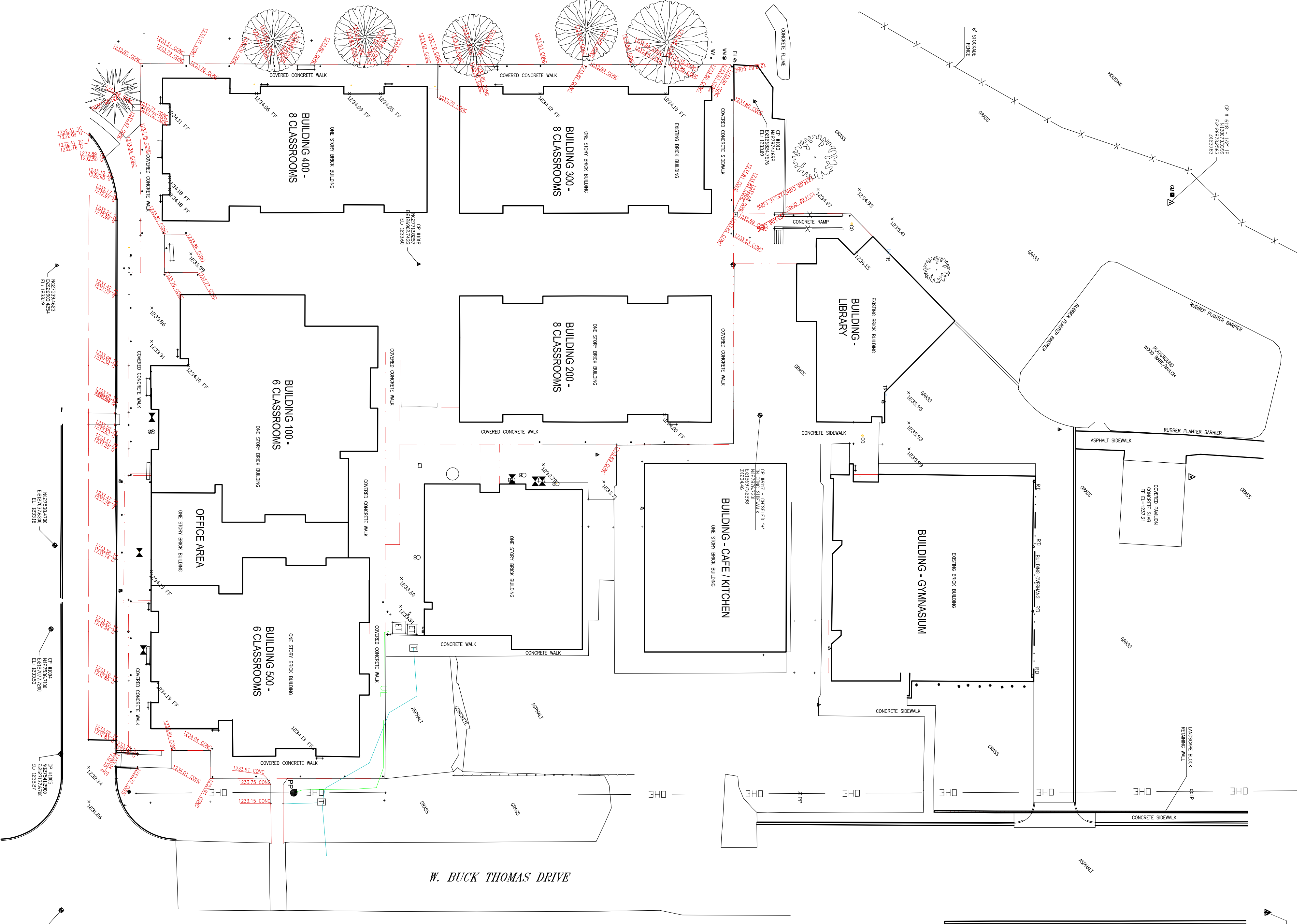
EXISTING OVERALL SITE PLAN

OWNERSHIP USE OF DOCUMENTS: AGP EXPRESSLY RESERVES ITS COPYRIGHT AND OTHER PROPERTY RIGHTS OF ALL PLANS AND DRAWINGS DESIGNED AND/OR PRODUCED HEREIN. REPRODUCED IN ANY FORM OR MANNER WITHOUT THE EXPRESSED WRITTEN CONSENT OF AGP.